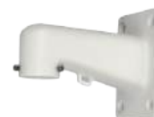
DH-PFB305W Wall Mount Bracket